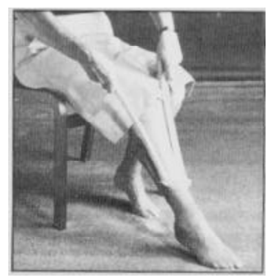
Maddak's Slip-On Dressing Aid uses its long handles with velcro covered ends to help users put on stockings, socks, underwear, or pants.

Stores such as J.C. Penney carry special lines of clothing for people who have difficulty dressing. For example, snaps or velcro fasteners instead of buttons can really make a difference if you have minimal use of your hands or a large cast. Also, if you are using a wheelchair for a period of time with a cast on your leg and do not have anyone to assist you with getting dressed, extra wide pant legs can make dressing easier, especially during the hot summer months. And, comfortable shorts are always cooler than sweatpants.