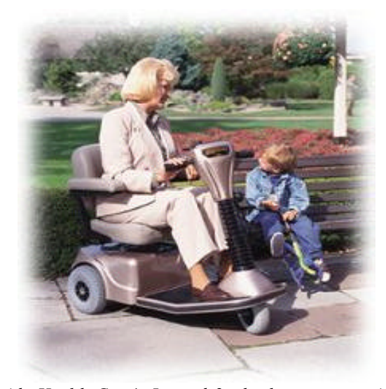
Pride Health Care's Legend 3-wheel scooter provides indoor and outdoor mobility.

If you expect to be unable to walk for a significant period of time, or if you are becoming weaker over time, you may want to invest in a scooter, which is a battery-powered cart. A scooter is particularly helpful if you will be traveling outside quite a bit, or if you will be traveling long distances down hallways or in mall areas. A scooter usually is not a good alternative for maneuverability around home because of its size and shape, so you may want to have a regular wheelchair, walker, or some other device to use around your home, depending upon your level of mobility.