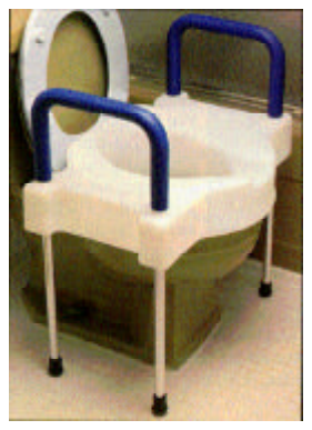
The Elevated Toilet Seat from Maddak features padded arm rests that also serve as grab bars to aid the user as he/she sits down.