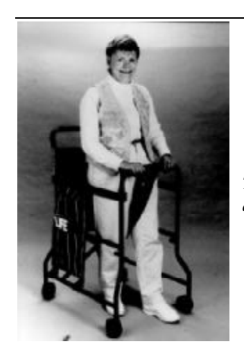
The Merry Walker is lightweight and can be folded for easy storage.

If you have read this far, you probably already have a set of crutches, because they are standard issue with virtually all lower extremity injuries or surgeries. When using crutches it is important to have them adjusted to the correct height. If they are too short, you will have to lean forward and use more energy with each step. Crutches that are too long place too much pressure under your arms. One symptom of crutches that are too long is a tingling in the hands caused by a decrease in the blood supply to the hands. Crutches that are too long also place you off balance and increase your risk of falling. Most standard crutches can be adjusted, however, to fit you and your needs.