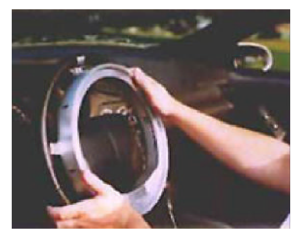
The Hand Drive Company features a driving hand control that allows people who don't have use of their legs to control braking and acceleration by pressuring rings installed inside of the steering wheel.

There also are attachments for the steering wheel (called spinners) that make driving possible for people with limited mobility in their arms and hands. Some spinners can be removed when not in use, so as not to impede another driver's use of the same vehicle.