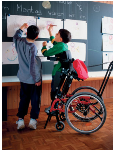
Figure 2: The Levo Kid from Levo USA is a child's standing wheelchair.

For more information on wheelchairs for children, including manual and powered models, see ABLEDATA's Fact Sheet on Wheelchairs for Children .