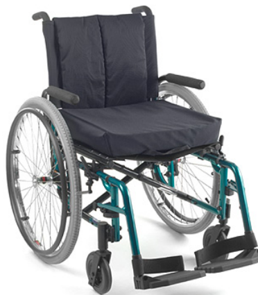
Figure 1: The Invacare MVP is a folding, standard/everyday chair.

This fact sheet provides a basic introduction to manual wheelchairs, including the main types, their components and features, and considerations for selecting a chair. It also offers a list of wheelchair manufacturers and sources of additional information, including publications, organizations, and Internet resources.