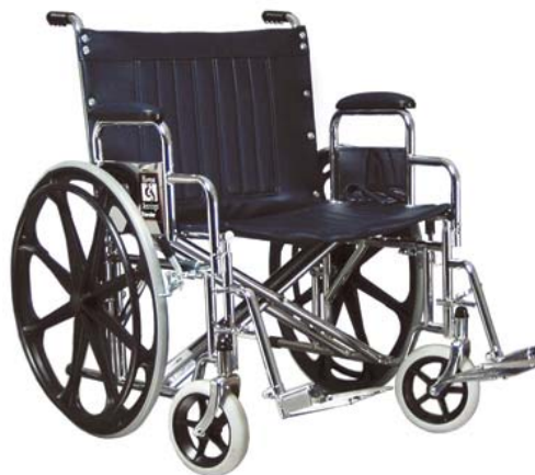
Figure 3: The Traveler XD wheelchair from Graham-Field Home Products is designed for large people weighing as much as 400 pounds.