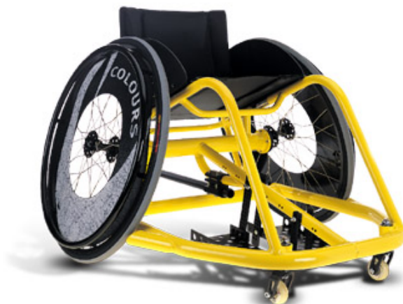
Figure 4: The Hammer from Colours In Motion is a sport wheelchair with rugged construction for use in contact sports such as rugby.

Sport wheelchairs come in a variety of configurations designed for specific sports. Many are three-wheeled. Models designed for use in wheelchair contact sports such as wheelchair rugby feature a wide front-end “hammer-head” made of aluminum tubing, suitable for banging against other wheelchairs. Rugby wheelchairs can be seen in use in the 2005 documentary movie Murderball , which follows a group of wheelchair rugby players through a series of championship games. Other popular sport configurations include racing, tennis, and basketball chairs. All-terrain chairs have a rugged frame and wheels that can roll safely over many unpaved and irregular surfaces. Beach wheelchairs have wide “balloon wheels” for rolling on sand. Many sport wheelchair manufacturers offer custom design.