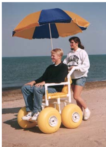
Figure 5: The All Terrain Chair from Assistive Technology, Inc. is a beach wheelchair with balloon wheels for moving on sand.

Transport wheelchairs are designed to be pushed by a caregiver or other person. They have push handles, with brake controls located within the caregiver's reach. On some models, the brakes are located on the rear wheels to enable a caregiver to toggle them using a foot. Transport wheelchairs are often used in hospitals and nursing homes. Other transport chairs are designed for specific environments, such as airports, and may have special features suited for these environments. For example, wheelchairs for boarding airplanes are very narrow in order to fit in airplane aisles.